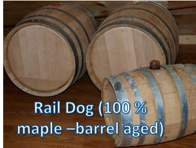
Rail Dog (100 % maple –barrel aged)

Kentucky Bourbon is at least 51% corn; Eau de vie is made from fruit sugars; Brandy is made from grape sugars; Canadian Whiskey is made from wheat grain sugar; Rye whiskey is made from Rye grain sugar; Cognac – grapes distilled in Cognac, France; Scotch Whisky – malted barley; and etc. etc. etc.