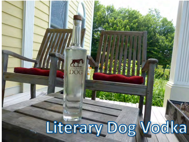
Literary Dog Vodka

We have two maple based spirits on Elm Brook Farm: